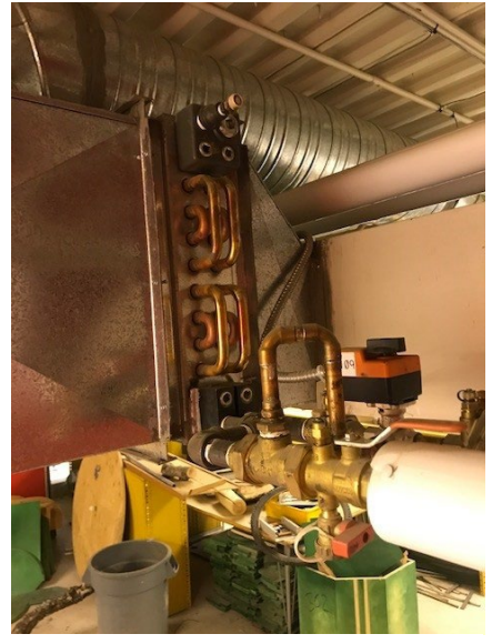
New coil and controls (Mount Sentinel)

Each year, the Board updates its Capital Plan that outlines various facilities and transportation initiatives to reduce the district's carbon footprint. We install LED lighting, upgrade building envelopes, replace or improve mechanical systems, all to reduce emissions. Building retrofits aim to reduce the district's carbon footprint, increase efficiencies, and reduce operating costs. The following building designs and retrofits were completed in 2023-2024: