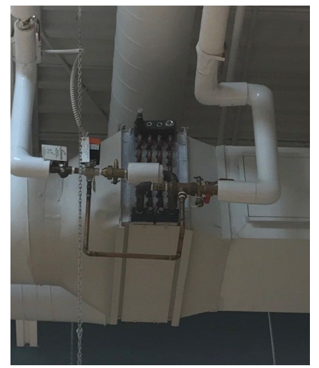
New coil and controls (Trafalgar)

By June 30, 2024, the School District No. 8 Kootenay Lake's final 2023 Climate Change Accountability Report will be posted to our website at <u>www.sd8.bc.ca</u>