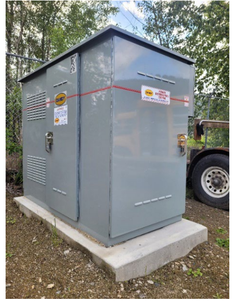
New charging kiosk (Nelson bus yard)

• Window replacement at Rosemont or Central Elementary